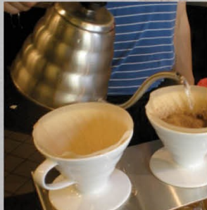
Popular method of brewing filter coffee in the US