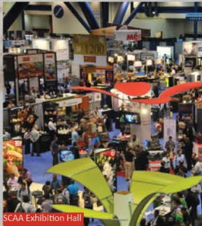
SCAA Exhibition Hall