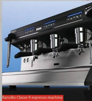
Rancilio Classe 9 espresso machine